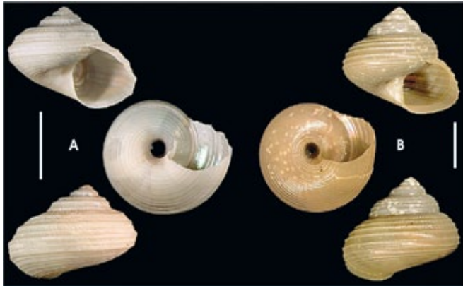
Two new species described from Bentart sampling. A: Antimargarita bentarti . B: Antimargarita powelli . Scale marks: 5 mm.