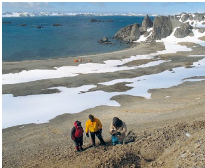
Paleontology team on the ground, near the encampment set up at Snow Island.