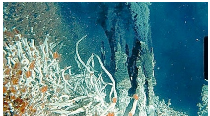
Photo of a black smoker and nearby tube worms, in the Juan de Fuca ridge, Pacific Ocean.