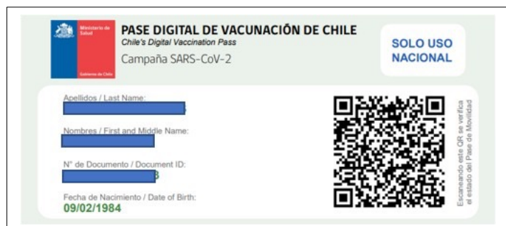
Figure 1. Sample Digital Vaccination Pass (for use by residents within Chile)